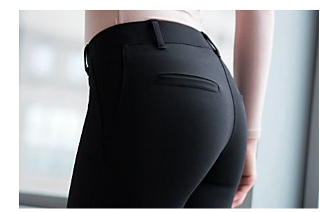
These yoga pants are the fasting selling pants in history