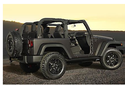
Don't Get Stuck With a Lemon: 15 Cars Not to Buy